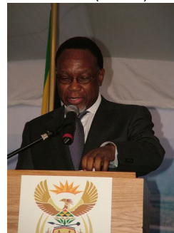
President Kgalema Motlanthe inaugurating the Project (PR)