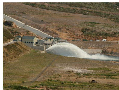
Water release (PR)