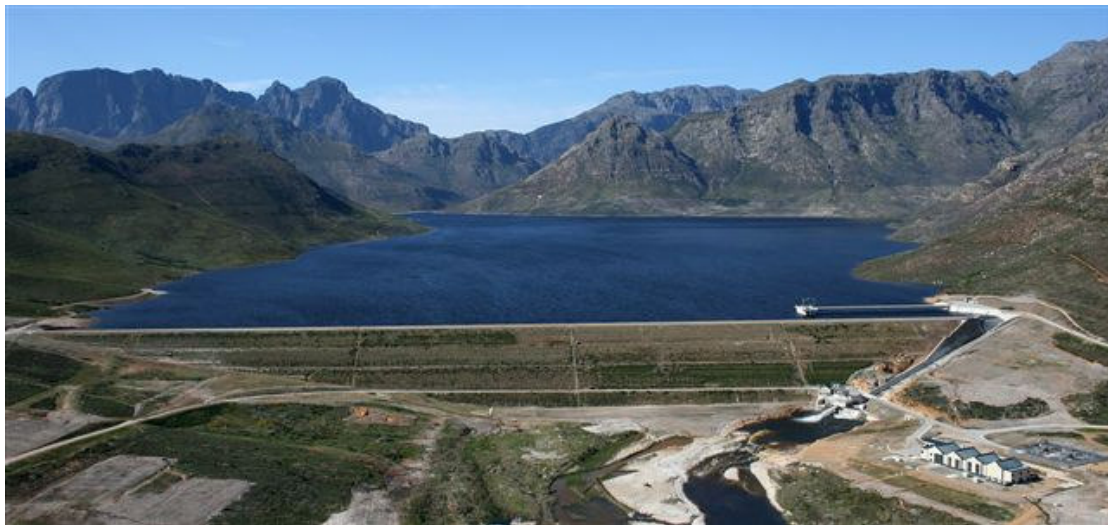
Berg River Dam: October 2008 (TCTA)

The Berg River Dam is a 70m high concrete faced rockfill dam. The Project was implemented and financed by the TCTA on behalf of the Department of Water Affairs and Forestry with the City of Cape Town being the primary stakeholder and beneficiary. The Project has received several awards for excellence. Photographs of the inauguration are shown below.