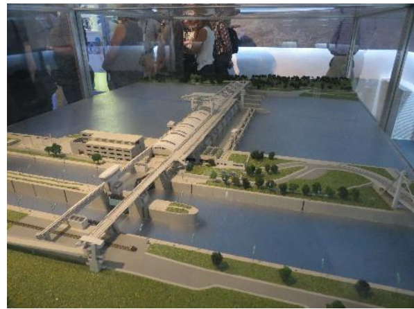
Model of Verbund Hydropower installation