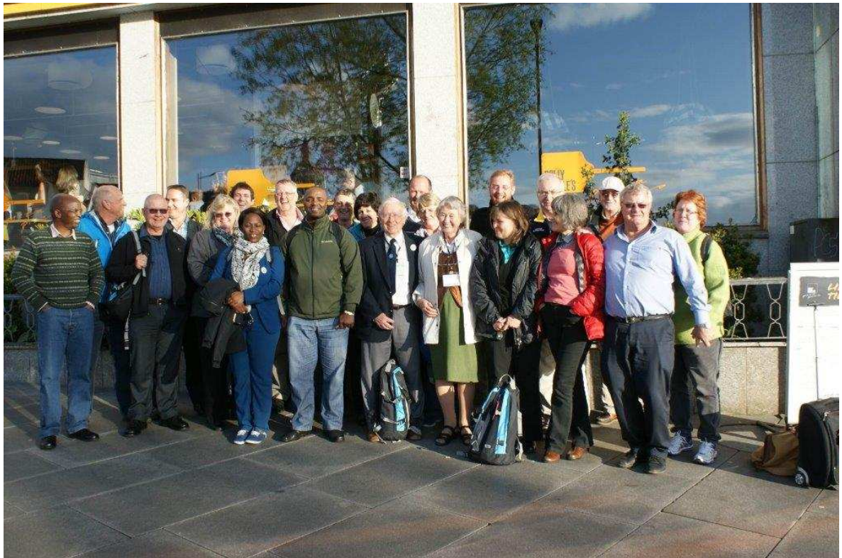
South African dinner in Stavanger (We could only afford pizza!)